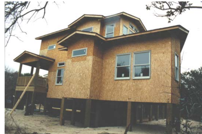
During construction, front

The existing cottage was renovated and a new entry added. Also included were two bedrooms and a bath on the First Floor as well as a dining room, screen porch and open deck along the back. The Second Floor consists of a master suite with open deck.