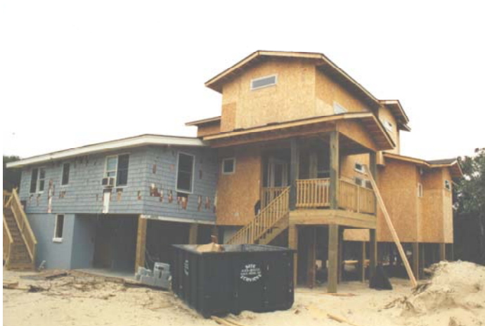
During construction; showing existing house